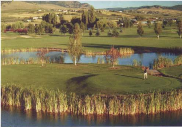
The Kelowna Springs Golf Club course is ringed by a set of low-slung, green-brown mountains. Kelowna Springs Golf Club